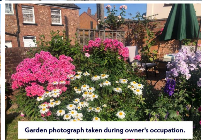
Garden photograph taken during owner's occupation.